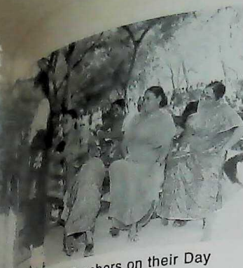
Session of gratitude To Teachers on their Day