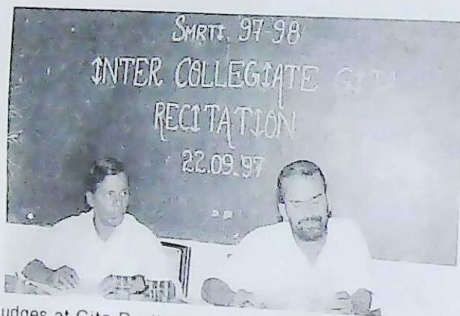
Judges at Gita Recitation