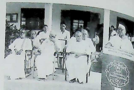
Honouring freedom fighters on Republic Day