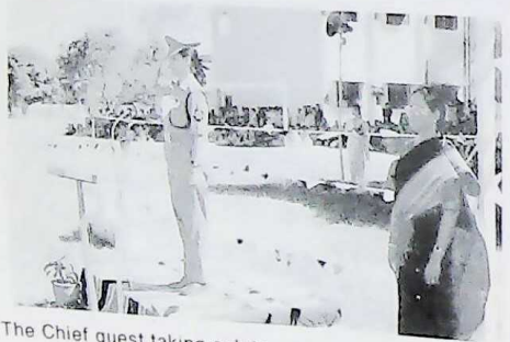
The Chief guest taking salute.