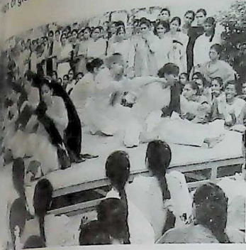
Inter Class dances