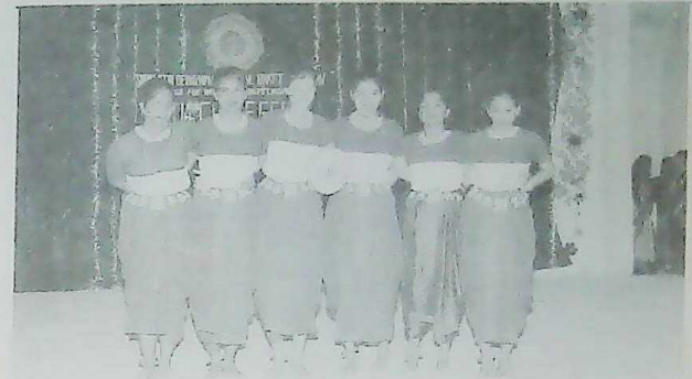
Our winning team at SMRTI