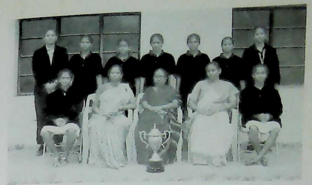
KHO - KHO