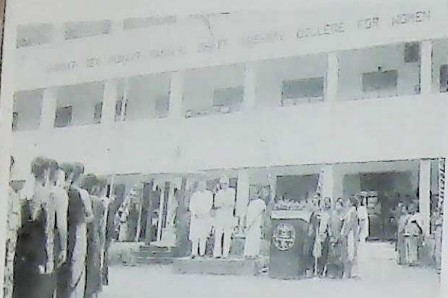
The College choir rendering 'Vande Mataram' on Independence day after flag hoist.