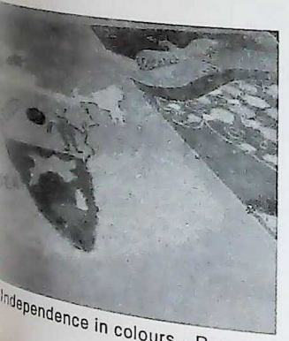
50 years of Independence in colours - Rangoli