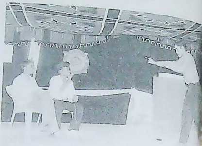
Silence is golden, Dumb Charades.....?