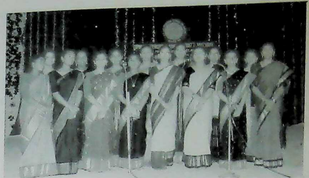
'Ye mera India, I Love You India.' Our college Choir