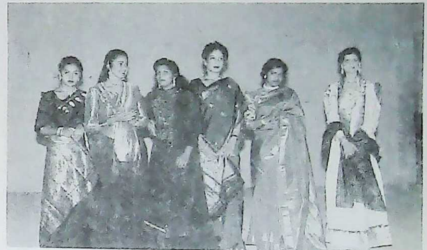
Fashion is the order of our day