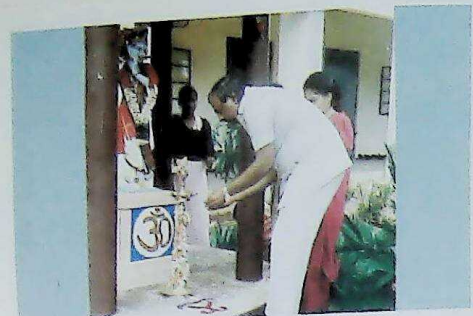
Shri V. Srinivasa Raghavan, Post Master General inaugurating the College Union