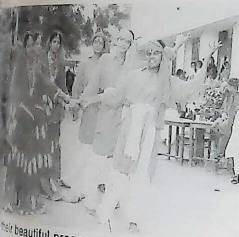
Their beautiful presence at the fashion show