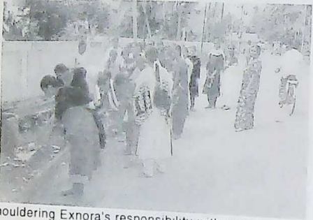
Shouldering Exnora's responsibility with ease.