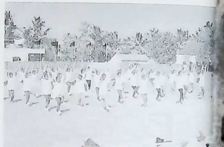
Lezeam Participants in action on Sports Day