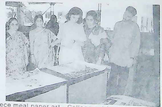
Piece meal paper art - Collage entries