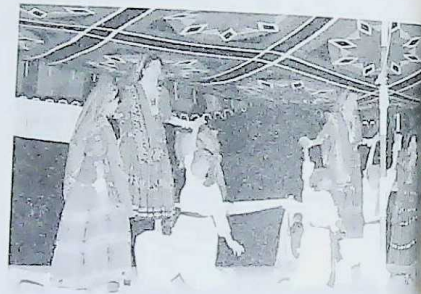
Jubilant expression of 50 years of Independence