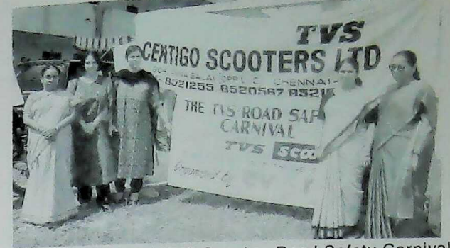
Centigo Scooters & TVS Scooty - Road Safety Carnival held in our college