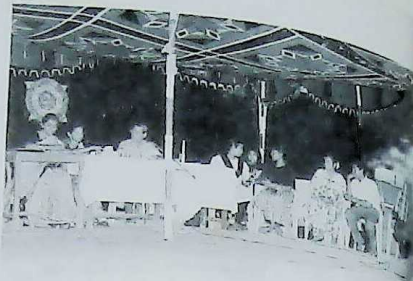
SMRTI - Our Cultural Extravaganza Challenging other teams of Quiz